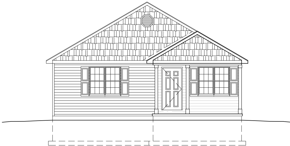
1 FRONT ELEVATION A-1